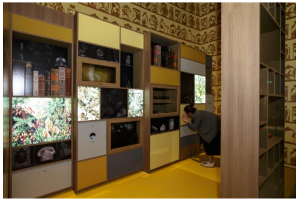
Cabinet of curiosities at first gallery, Building Nature's Treasure House

Threading through Treasures of the Natural World is an interactive treasure hunt specially curated by ArtScience Museum to engage children, families and schools. Interactive activities are incorporated to each of the five themed sections of the show. Combining art and science, the treasure hunt adds interactivity and immersion to the exhibition, ensuring it is accessible to visitors of all ages.