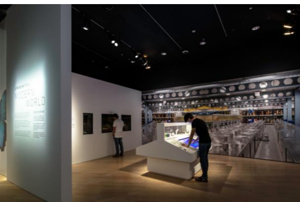
Digital laboratory at A Museum for A Modern World

The exhibition ends with A Museum for A Modern World , which provides visitors with a close look at the scientific pursuits and breakthroughs undertaken by the 350 research scientists working at Natural History Museum. The final interactive activity in the treasure hunt, is a digital laboratory that shows how scientists use natural history to solve problems facing us today.