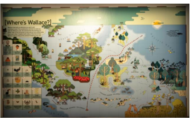
Where's Wallace at Treasures of the Mind

The first stop of the treasure hunt is located in the Building Nature's Treasure House gallery. It is designed to spark inquisitiveness, as visitors explore a cabinet of curiosities. The multisensory cabinet features tactile drawers, a sound box, a peep hole, a light box, an excavation drawer and kirigami drawers. It is inspired by Sir Hans Sloane, whose vast private collection of natural history specimens formed the basis of the British Museum and later, the Natural History Museum.