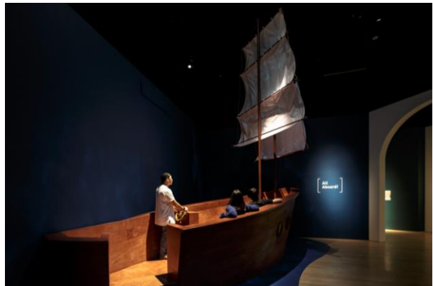
Specially constructed tall ship at Treasures of Exploration

study of evolution. Where's Wallace is a large wall graphic which invites visitors to find Wallace and 18 hidden collectibles which are inspired by both Wallace's life and his collection displayed within the gallery. It also features the famous Wallace Line, the faunal boundary line drawn in 1859 by Wallace separating the eco-zones of Asia and Wallacea.